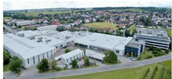
mayr®-headquarters in Mauerstetten

mayr® sets standards in power transmission with economically viable solutions. For maximum competitiveness of your machines and systems, we always aim for the best possible cost efficiency, starting during the development of your clutch/coupling or brake right up to delivery of the finished and inspected product. For cost-efficient production, our Production plants in Poland and China represent the perfect supplement to our headquarters in Germany.