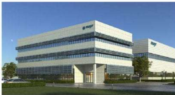
Subsidiary with production department — mayr®-China