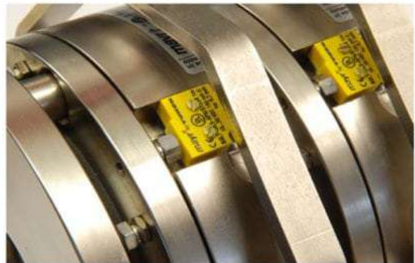
Contactless release monitoring: wear-free, robust, magnetic field-resistant, reliable.

Due to the fact that no mechanical parts are used, the release monitoring with proximity switch is wear-free. The service lifetime is independent of the switching frequency. Furthermore, the system is magnetic field-resistant and works absolutely reliably. It is also resistant to impacts and vibrations, as there are no movable parts, and the electronics are completely encapsulated.