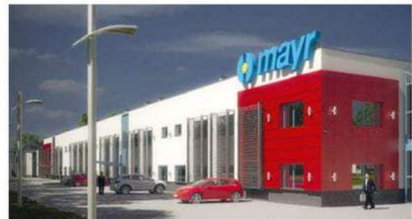
Subsidiary with production department — mayr®-Poland